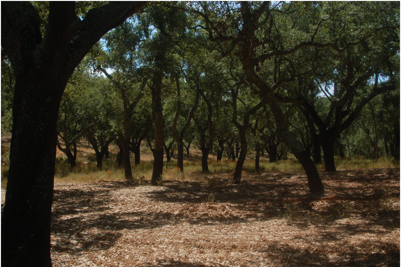
Figure 2: Montado landscape with cork oaks near Evora (Portugal).

19 th century, the larger ships and the coming of steamships caused the islands to lose their place as hubs. They also lost their position in the trade in agricultural products, when land transport was improved by railways and, later, motorways (Renes, 2014).