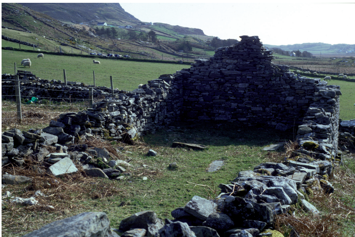
Figure 3: Ruined church in Connemara.

There is yet another aspect that explains part of the continued existence of landscapes with many historic features: namely the capacity of landscape structures to adapt to changing circumstances. There is a tendency among (landscape) architects and planners to think in terms of the principle of 'form follows function'. In this discourse, changing functions are thought to beget new forms, and the preservation of old structures is deemed anachronistic. During my years as a consultant for the Dutch Ministry of Agriculture, planners and landscape architects tried to convince me that the remaining small-scale agricultural landscapes were unsustainable and would disappear quickly.